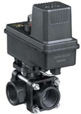
344 BPR Series