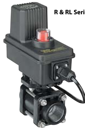
R & RL Series