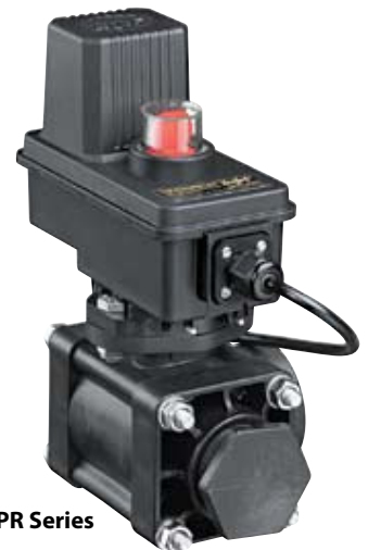
346 BPR Series