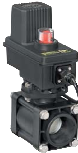
346 R Series