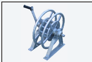
EW2012M (High Pressure)