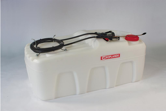
400 Litre Spot Sprayer