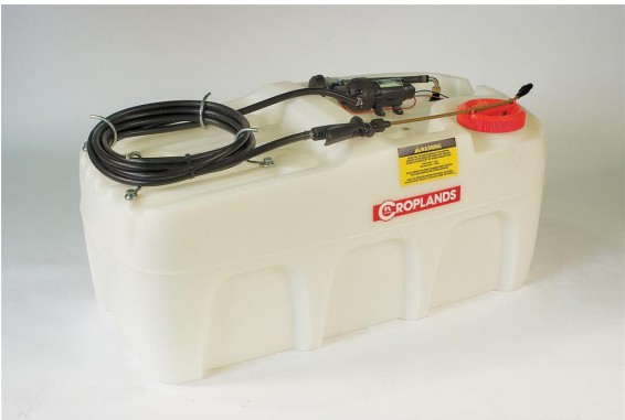
200 Litre Spot Sprayer