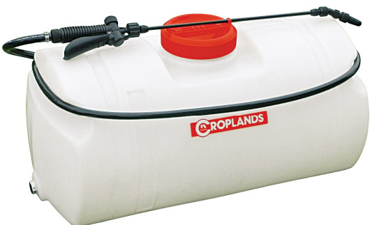
30 Litre Spot Sprayer