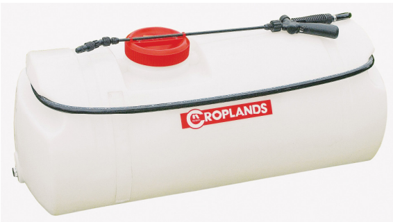
100 Litre Spot Sprayer